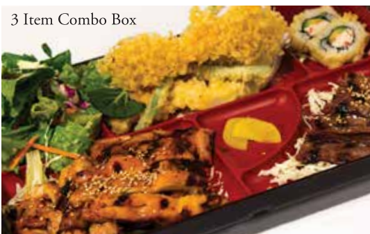
3 Item Combo Box