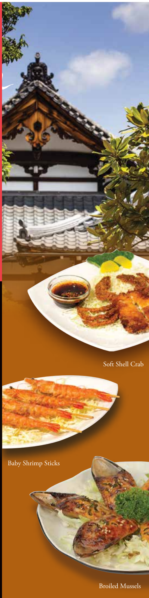
Soft Shell Crab